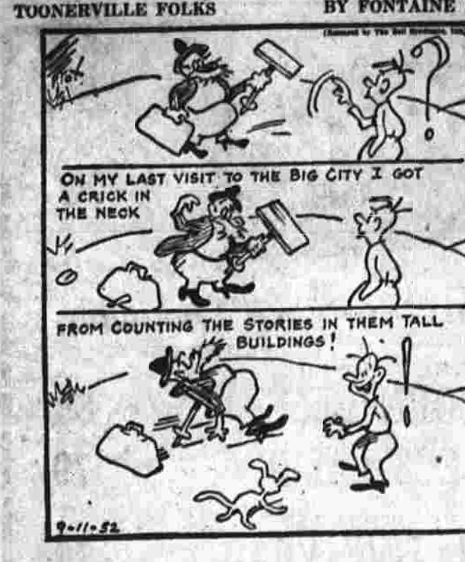
TOONERVILLE FOLKS BY FONTAINE FOX