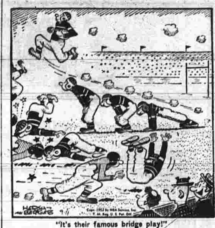
"It's their famous bridge play!"