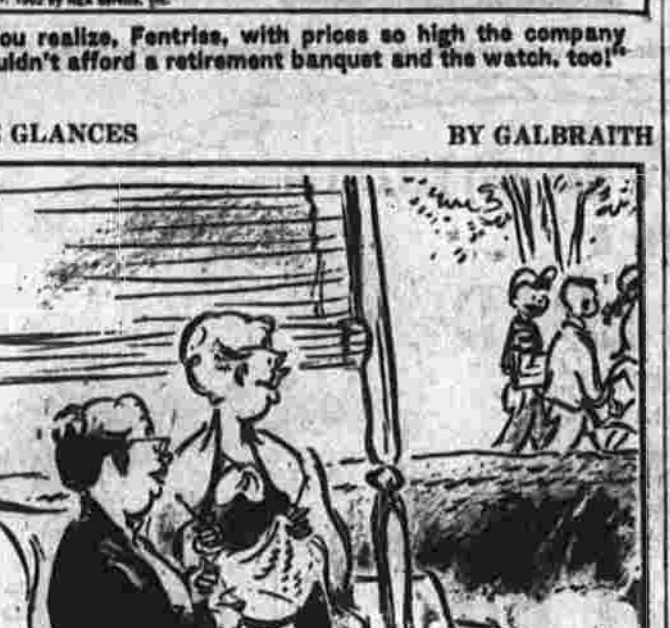
SIDE GLANCES BY GALBRAITH