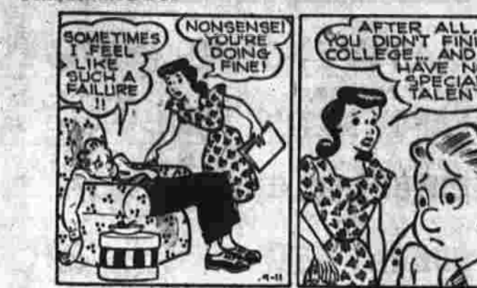
PRISCILLA'S POP BY AL VERMEER