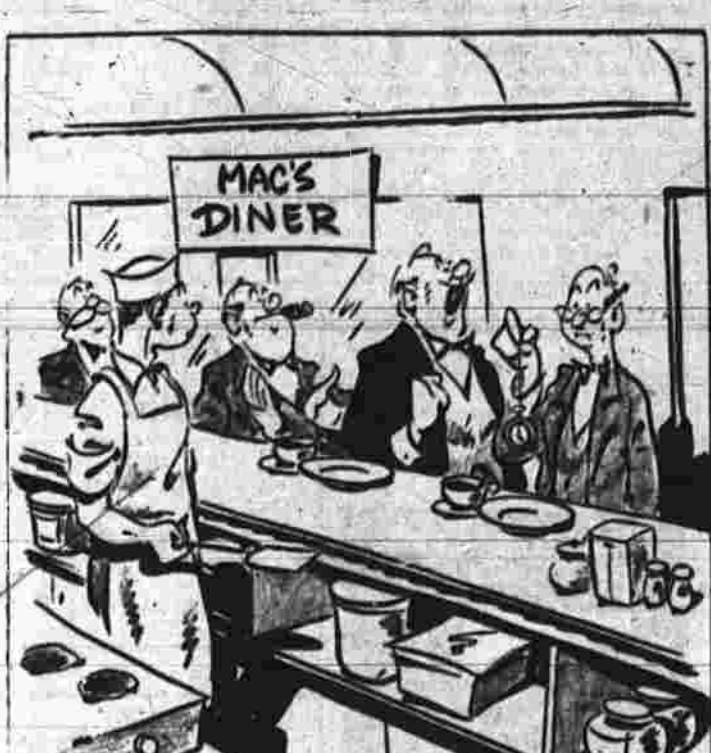
"You realize, Fenrites, with prices so high the company couldn't afford a retirement banquet and the watch, too!"