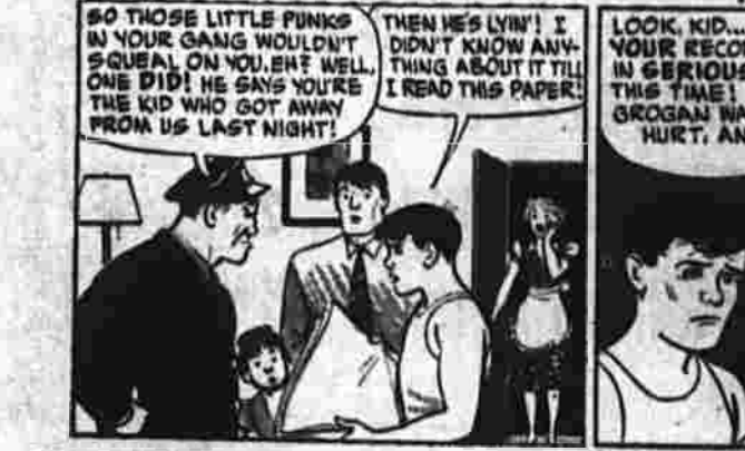
CAPTAIN EASY BY LESLIE TURNER