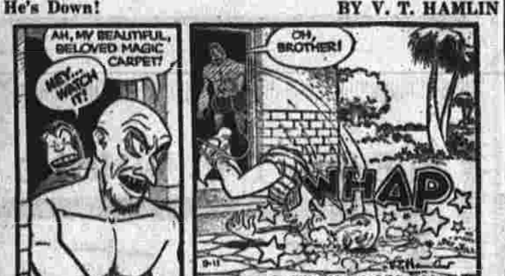
He's Up, He's Down! BY V. T. HAMLIN