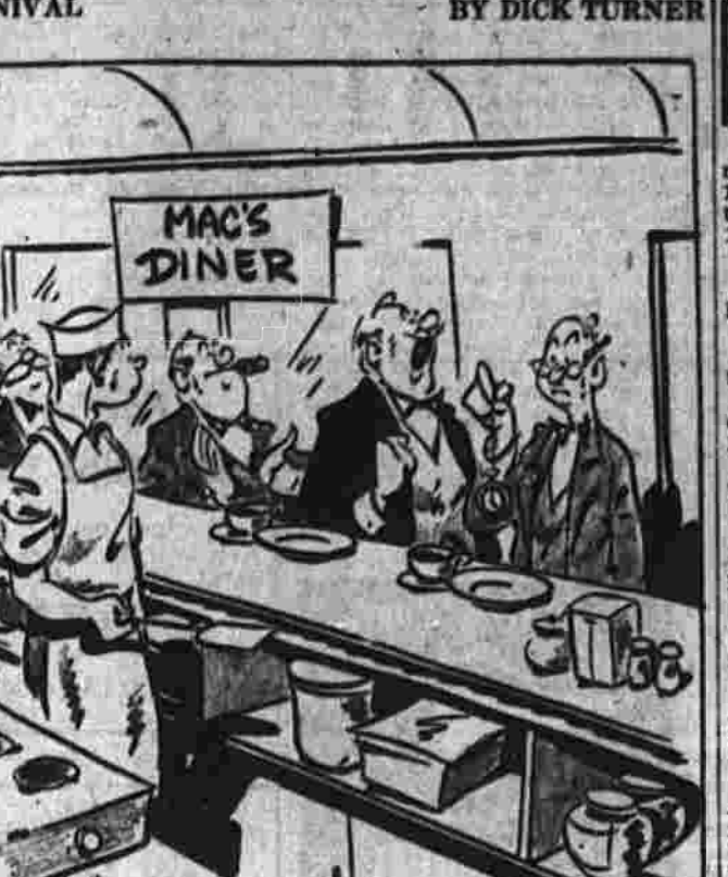
CARNIVAL BY DICK TURNER