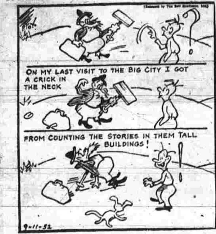
ON MY LAST VISIT TO THE BIG CITY I GOT A CRICK IN THE NECK