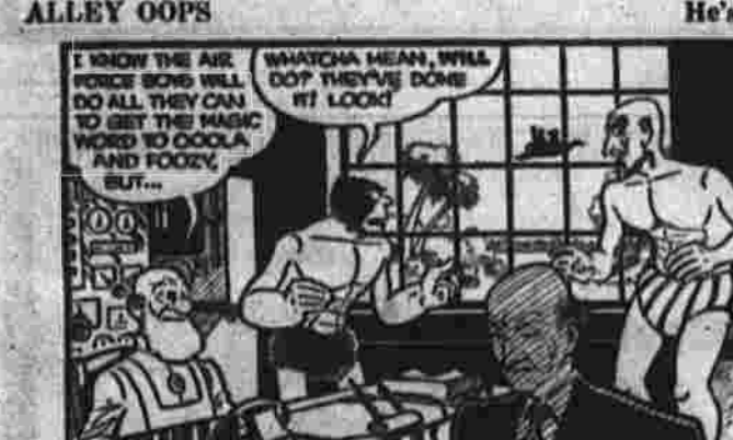
ALLEY OOPS BY V. T. HAMLIN