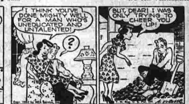
Problem For Cathy BY LESLIE TURNER