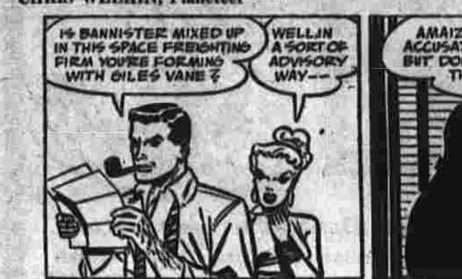
A Warning BY RUSS WINTERBOTHAM