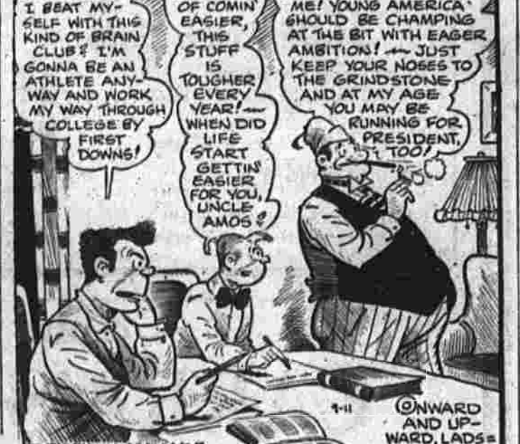
OUR BOARDING HOUSE with MAJOR HOOPLE